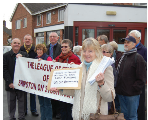
Supporters campaigned to protect Low Furlong when concerns about its future were first raised.