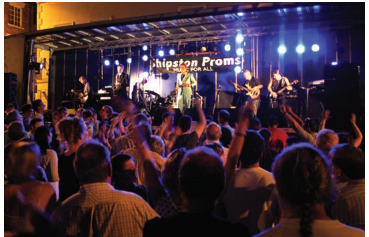
Ultimate Bowie in full swing.

Shipston Town Council and 40 businesses, hotels, restaurants and pubs in the area sponsored the Proms.