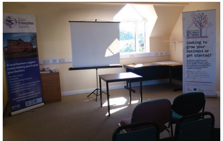
One of the training rooms available to local businesses at the SEC

To find out more, visit www.stourenterprise.co.uk