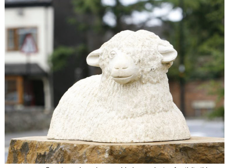
Our stone sheep has presided over plenty of activity this year

There have been plenty of challenges along the way, particularly in budget and planning terms, with many proposals for major developments coming forward and increased financial pressure on popular services.