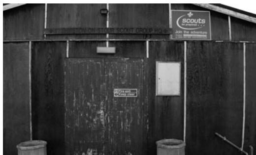
Above: The existing Scout Hut.

From front page: Shipston is one step closer to a new Scout hut after a court agreed that housing developers should hand over £125,000.