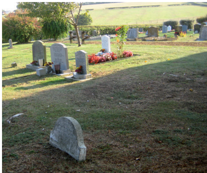
The cemetery: One of the services for which the town council is responsible

"We didn't have an election four years ago because there were not enough candidates. We would like Shipston to have an election and for all residents to have a say in who represents them, but we need more people to put themselves forward to make that happen," the Mayor continued.