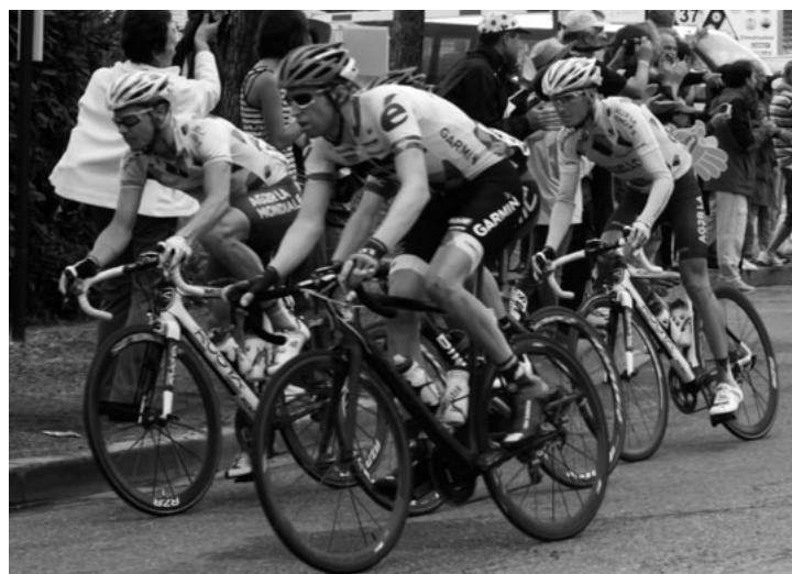
SHN will be hosting its own version of the Tour de France later in the year!

To book tickets or find out more, contact Rebecca Mawle on 01608 674929.