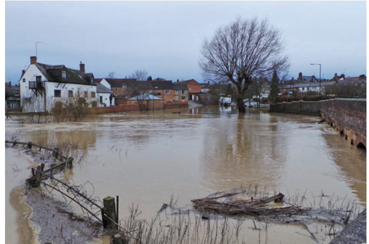
Flooding on Mill Street.

As part of the Emergency Plan, urgent-response volunteers were on hand to help move residents' furniture in the event of their homes flooding and the Sheldon Bosley Hub was set up to provide temporary shelter if necessary. Thankfully this wasn't needed this time but the arrangements are in place should they be needed in future.