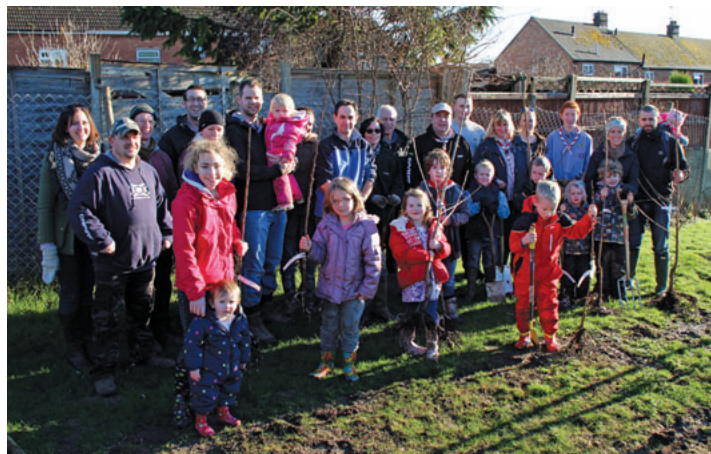
Volunteers turn out in force.

planting the trees. The space already looks better with the new trees installed and we are all looking forward to watching them flourish in the coming months."