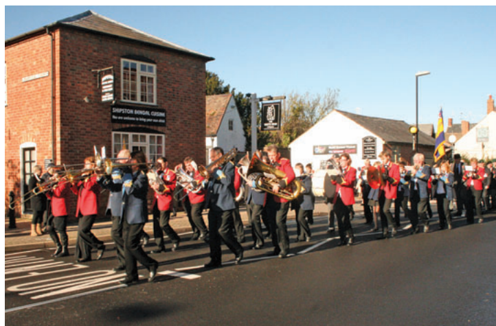
Shipston Town Band also supports the Royal British Legion at the annual Remembrance Parade