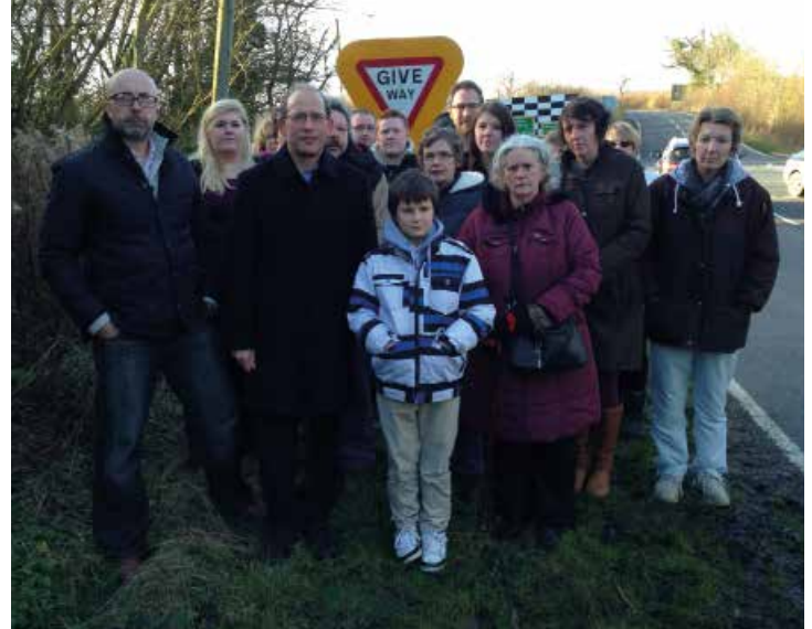
Concerned residents pictured at the site of the crossroads