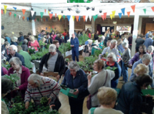
The Hub was packed with plants and gardeners