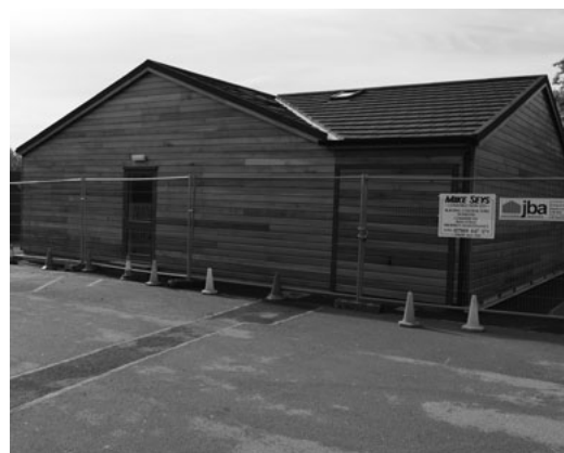
The new Scout Hut is almost finished