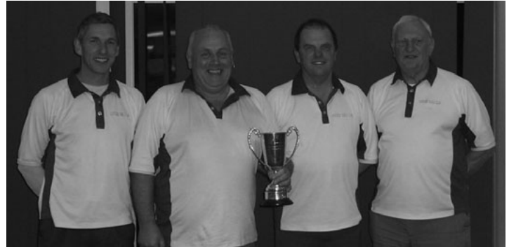
The Norgren winning indoor bowls team proudly show off their trophy