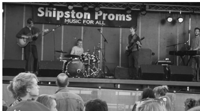
Fame contest winners, Longfellow, took to the stage at last year's Proms

Shipston Proms highlights include Loyd Grossman's band, The New Forbidden, on 21st June, and Benjamin Britten's community opera Noye's Fludde, performed by Orchestra of the Swan on Friday and Saturday 28th and 29th June.