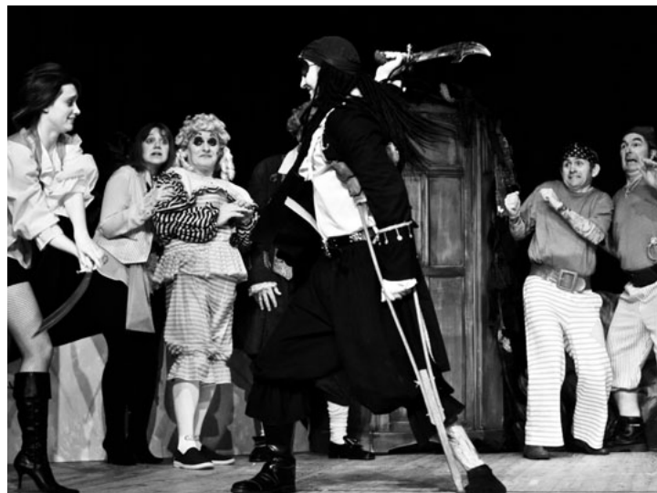
Above: Shipston Dramatic Society in action at the Townsend Hall.

The group's next production will be in May 2012. If you fancy joining the group to tread the boards at the Townsend Hall in the future, take a look at their website www.shipstondramagroup.org for more information.