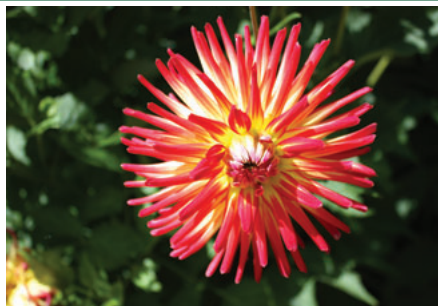
One of the winning blooms at Ellen Badger Hospital

The judges of this year's Shipston in Bloom gardening competition were hugely impressed with the colourful spectacle that awaited them as they began the process of assessing the town's gardens, containers and allotments.