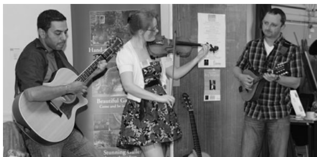
Performers at a previous Community Arts Festival.

The festival is open from 2-5pm on Saturday 21st September and 10am-4pm on Sunday 22nd September at the Townsend Hall in Sheep Street. For more details, see the advert on page 9.