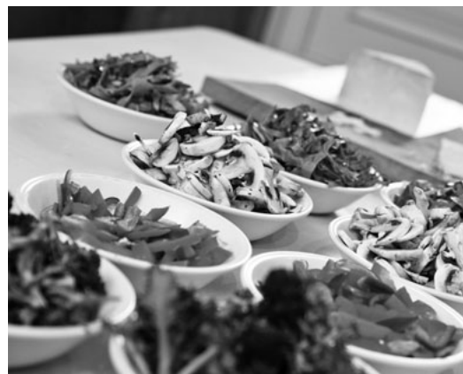
Tasty treats are in store.

The event runs from 10am to 4pm in the High Street, with competition entries invited from 9am to 10am. To vote for your favourite local producer (within 30 miles of Shipston), please email dan@shipstonfoodfestival.co.uk . For all the latest news on the event, follow @ShipstonFood on Twitter, visit www.shipstonfoodfestival.co.uk or like the event's Facebook page at www.facebook.com/shipstonfood