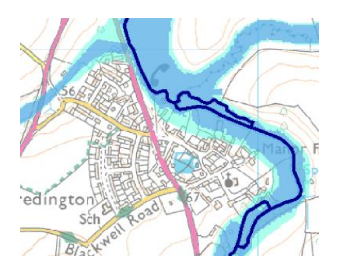
Tredington Flood Risk Area