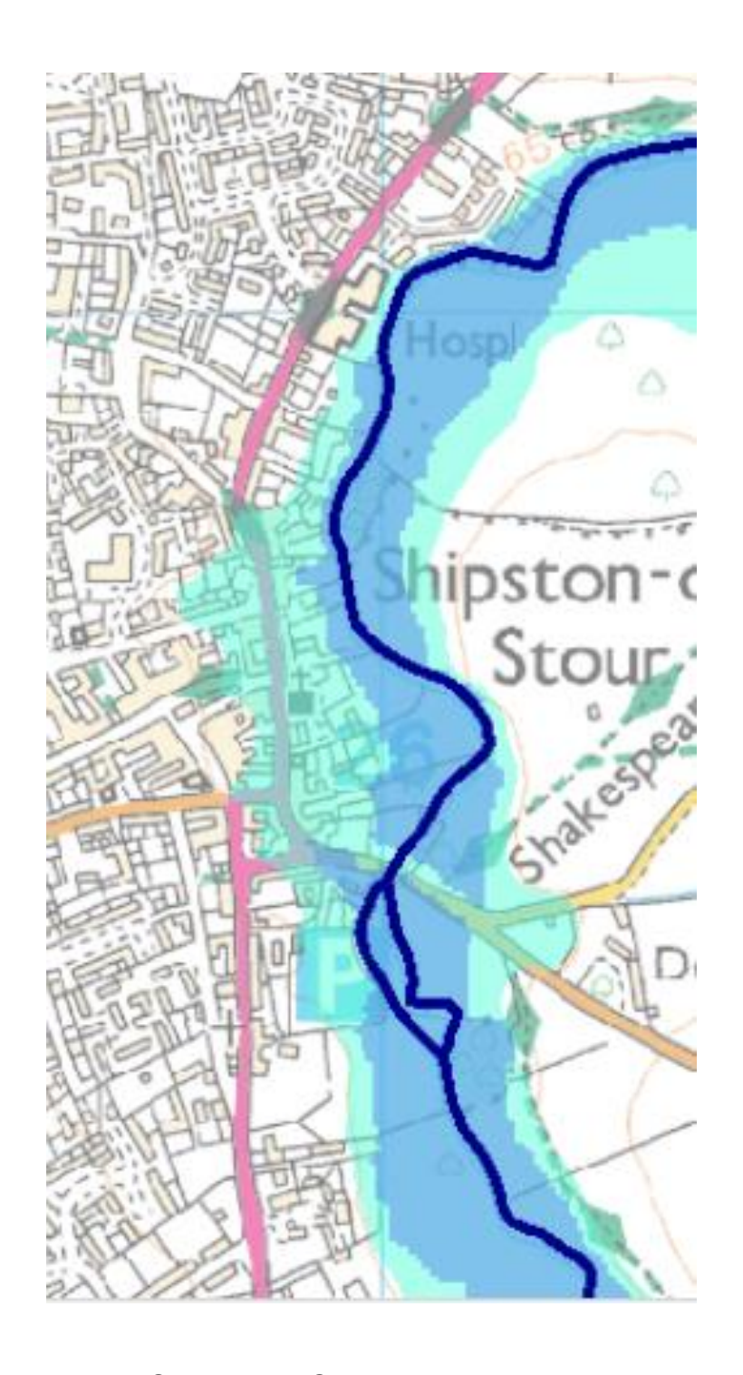
Shipston on Stour Flood Risk Area